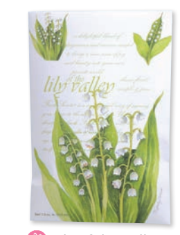
& Lily of the Valley