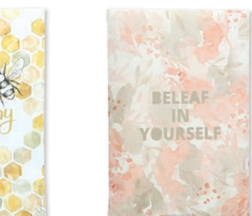
& Beleaf in Yourself