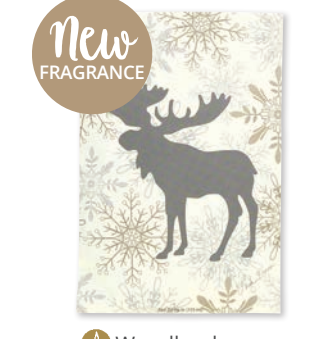
-Seasonal Scents ship June 1 through December 15. -