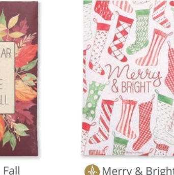
Merry & Bright